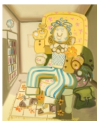
Hannah Barrett Cocktail Hour , 2018 Oil on canvas 42 by 34 in. (106.7 by 86.4 cm) 0003-PA