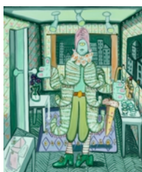
Hannah Barrett Bouffant , 2018 Oil on canvas 48 by 40 in. (121.9 by 101.6 cm) 0000-PA