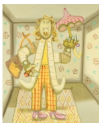
Hannah Barrett Sample Sale , 2018 Oil on canvas 42 by 34 in. (106.7 by 86.4 cm) 0002-PA